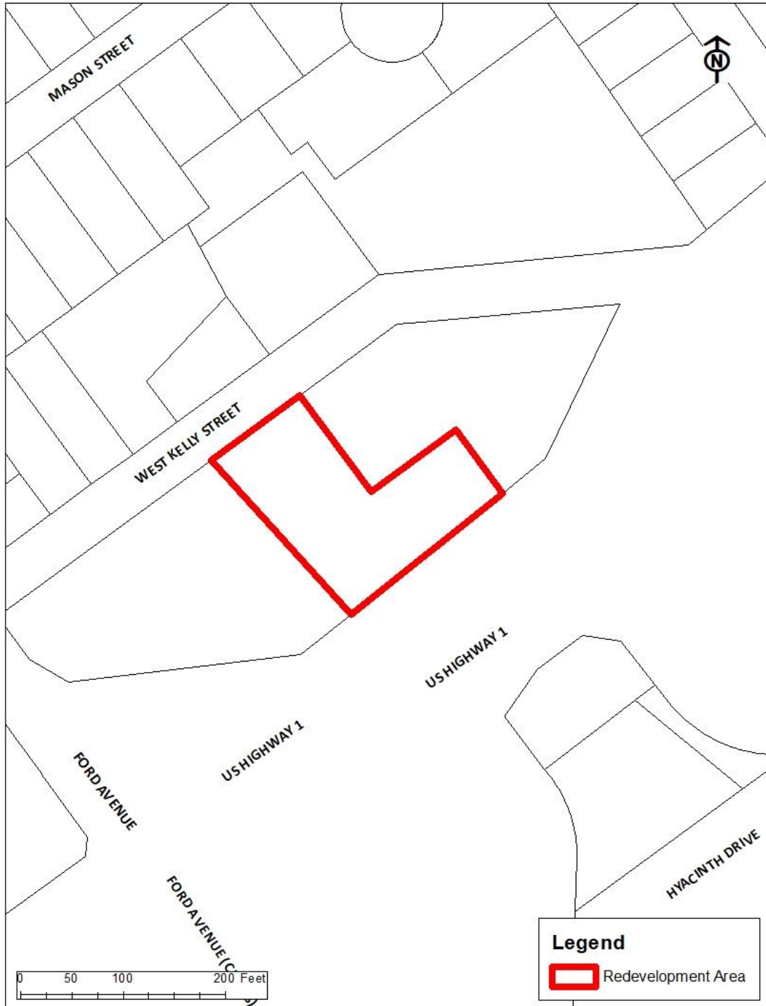
Figure 1: Redevelopment Area Parcel Map