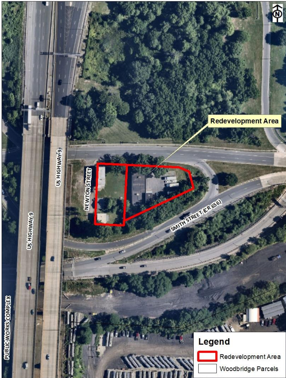
Figure 1: Redevelopment Area Parcel/Aerial Map