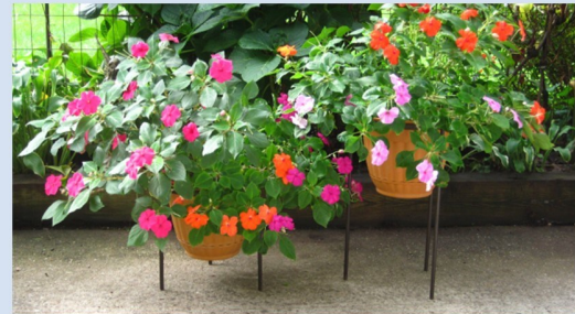
Metal Work by Garden Metal Works