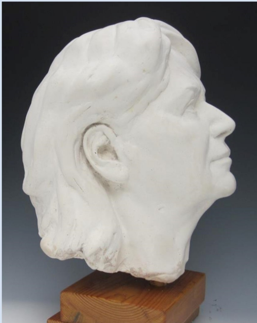
Sculpture by Konstantin Zingerman

DEADLINE: Registration emails must be received by September 2, 2022