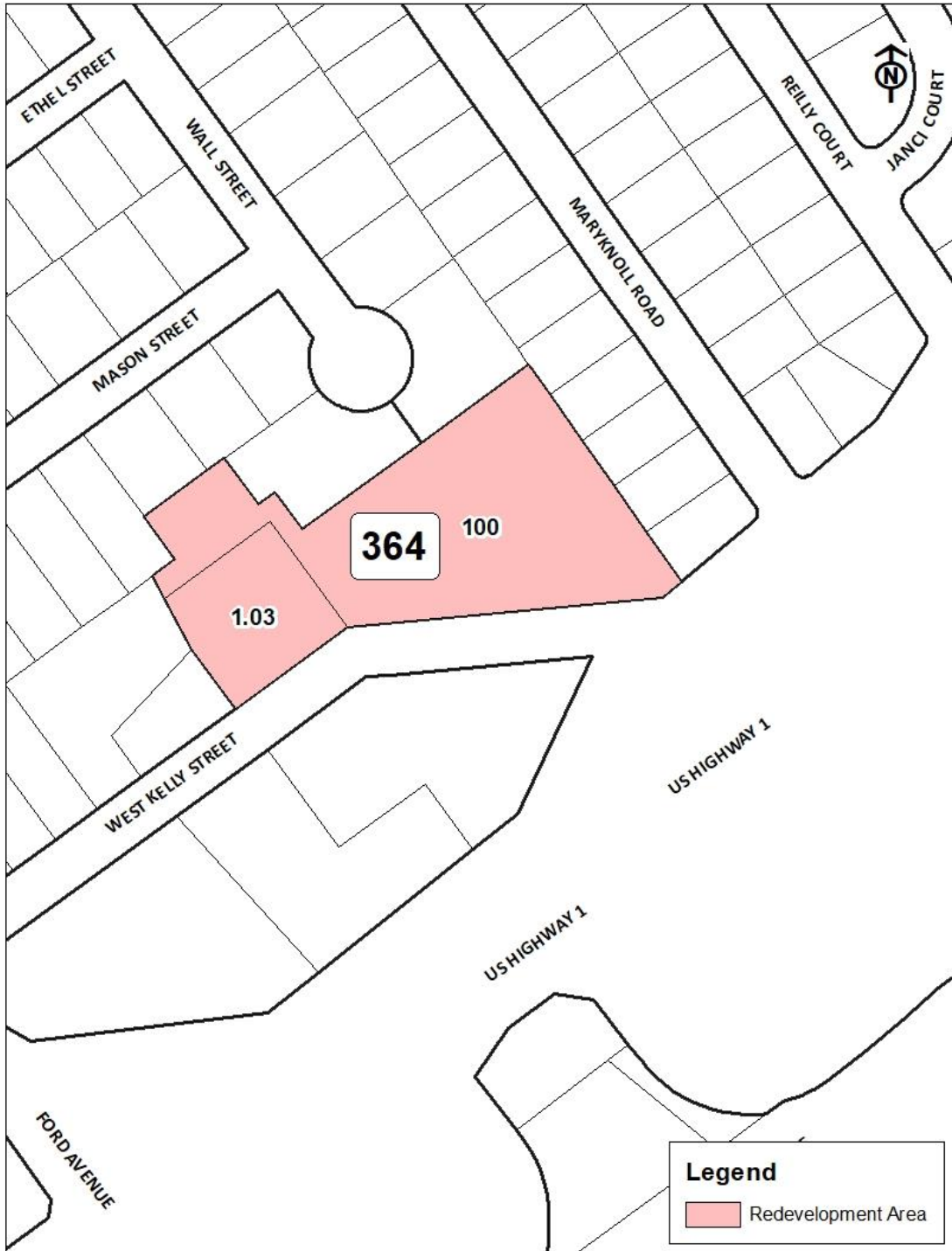
Figure 1: Redevelopment Area Parcel Map