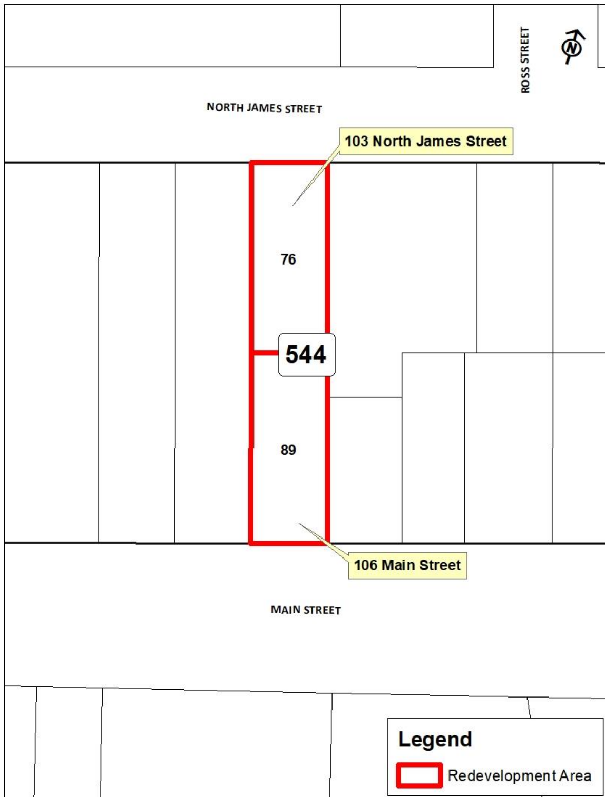
Figure 1: Downtown Woodbridge, Area 7 Parcel Map