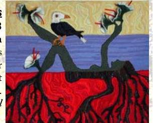
"Growth" by Linda Rae Coughlin, Fiber/Mixed Media

A portion of the proceeds from "The Earth Speaks" will be donated the Woodbridge River Watch 501 (c) (3).