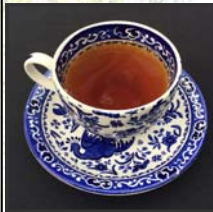
Exhibit: The Earth Speaks