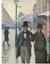
Paris Street, Rainy Day" by Gustave Caillebotte

All lectures begin at 7:30pm. Reservations Required. Call (732)634-0413