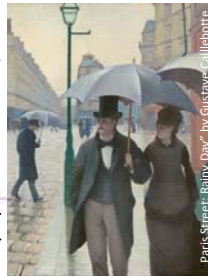
Paris Street: Rainy Day by Gustave Caillebotte