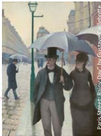
Paris Street; Rainy Day by Gustave Caillebotte

PERFORMANCE: The University of the Philippines Alumni & Friends Rondala with Special Guests the Ligaya Cultural Group