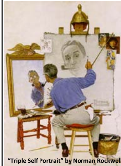
"Triple Self Portrait" by Norman Rockwell