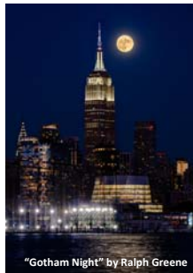
"Gotham Night" by Ralph Greene

Night photography can be challenging, but it is also fun and intriguing. Scenes appear completely different at night than during the day. Reflections, cityscapes, trailing lights, stars/milky way, moody street scenes, light painting and light graffiti are all possible subjects for this exhibit. Explore the night and see what develops.